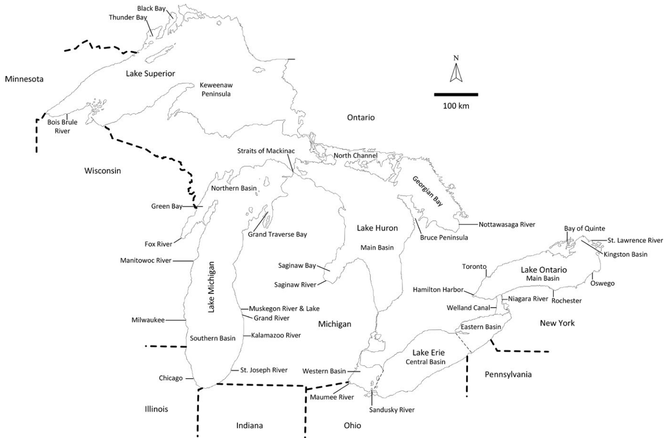
FIGURE 1 Map of Great Lakes basin locations mentioned in text