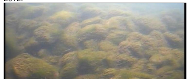
Figure 2. Underwater photo of bottom habitat off 18 Mile Creek in Lake Erie, July 2011.

Additional sidescan data collection occurred at Hoover Point East in 2011, identifying more potential lake trout spawning sites on the southern end of the point (Figure 1). Reconnaissance survey work was started at the Maitland Ridge, located east of previously investigated shoals. This large (15 x 25 km) feature appears to be covered with mostly sandy substrates, although bad weather forced the survey to be reduced. Further investigation is planned for 2012.