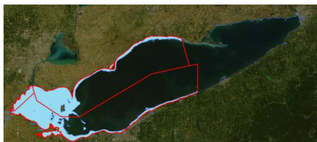
Figure 3. Present quota sharing allocation ( \leq 13\text{m} ; light blue) by jurisdiction (red).

With the assistance of the Walleye Task Group and lead by researchers at the University of Windsor, we utilized a logistic regression approach (Pandit et al.) to establish the relationships between a variety of abiotic conditions and the probability of occurrence of walleye (presence / absence) from a set of fishery and environmental variable linked datasets (Ontario Partnership Index Gillnet). This species-habitat model for adult walleye uses environmental variables that were not only deemed appropriate for walleye but also for which datasets currently exist and provide somewhat broad-scale (location and time) coverage, including temperature, dissolved oxygen, and light attenuation (Secchi depth). Consistent with the literature, the probability of